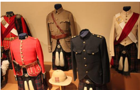
Fig 27 A Variety of Highland uniforms.