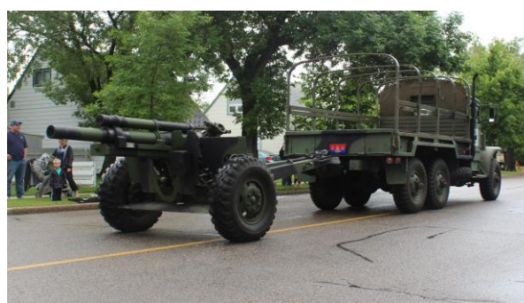
Fig 24 C1 105 MM Howitzer and 2 1/2 Ton Truck

United Commercial Traveler's (UCT) Travelers Day Parade June 2012.