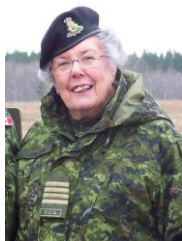
Fig 5 Exercise Prowling Gunner