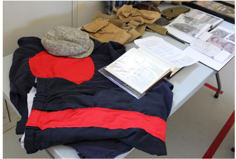
Fig 20 German POWs uniform with red disk on back of tunic and wide red stripe on leg.