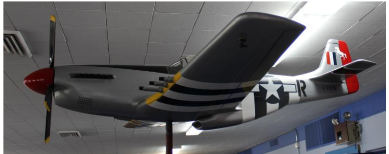
Fig 28 Model of a P51 Mustang Fighter at 17 Wing.