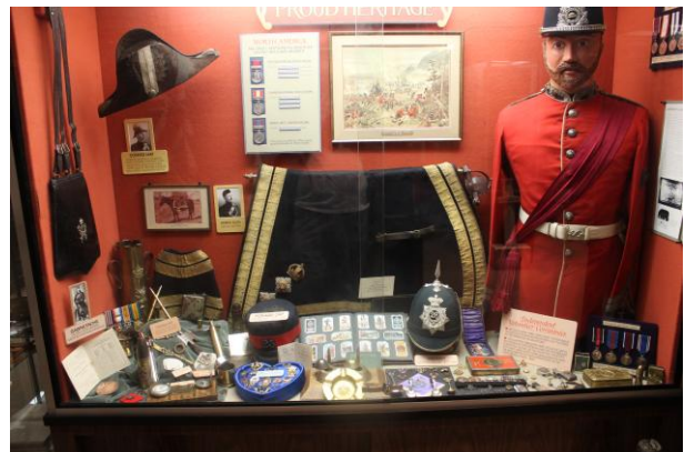
Fig 30 A display case at the Royal Winnipeg Rifles Museum showing artefacts for the 1800s.

www.26fdregmuseum.com or www.12mbdragoons.com