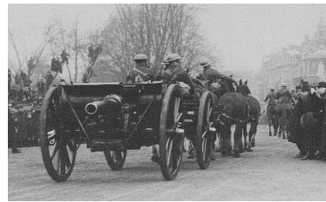
Fig 1 An 18-pounder field gun from the Canadian Field Artillery parading through Liege at the end of the war