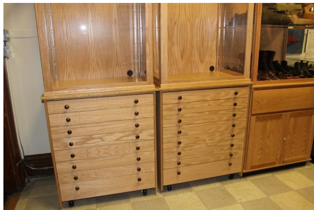
Fig 18 Bennett Collection display cases.