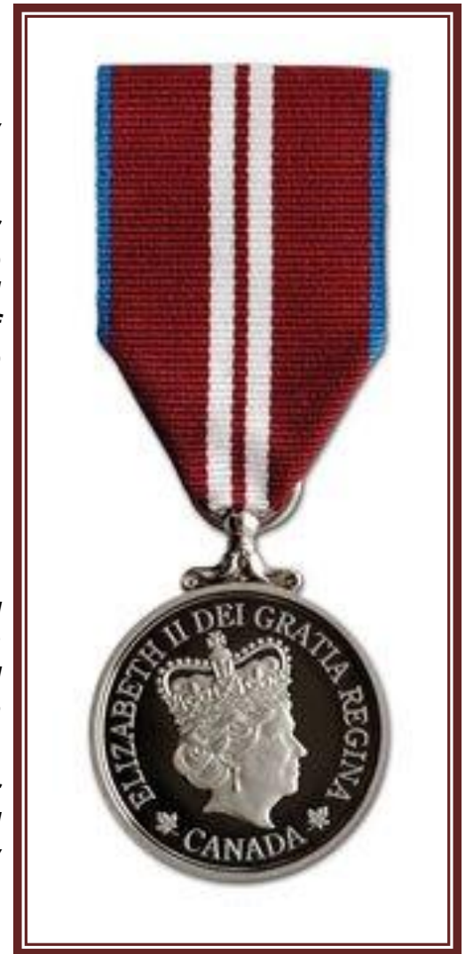
Fig 2 Queen's Diamond Jubilee Medal

These three gentlemen are to be congratulated on the recognition they have deservedly received. They display the calibre of volunteers who serve the Museum.