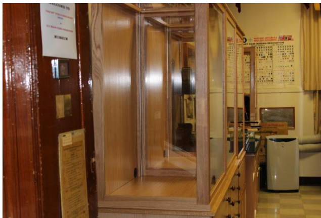
Fig 17 Bennett Collection display cases.