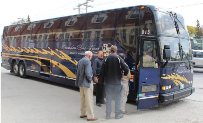
Fig 29 Visitors climb on the Brandon Bus Lines highway cruiser for the next museum on the tour.