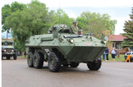
Fig 23 Grizzly Armored Personnel Carrier