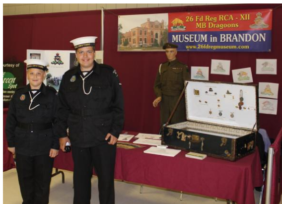
Fig 22 60 RCSCC Swiftsure Sea Cadets visit the Museum booth while on break from community service