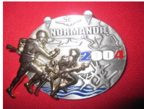
Figure 11. The Normandy Chest Medallion