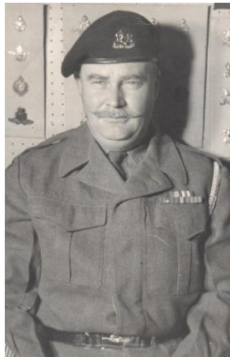
Figure 6 .WO2, A Squadron Sergeant Major (SSM) XII MB Dragoons