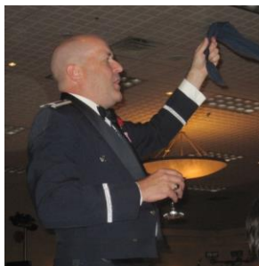
Fig 33 member of the USAF salutes the USAF official song.