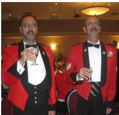
Fig 30 The Brothers Popovits stand for the Artillery Salute.