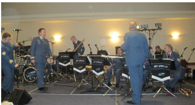
Fig 28 The RCAF Band Jet Stream sets up to rock the night away

Royal Canadian Air Force Band provided the music for the regimental marches, Royal Salute and Salute to the President of the USA. The Military Ball had the privilege to have sixteen members of the United States Air Force and their spouses at the ball. Members of the USAF have attended the mil ball on a regular basis for several years and soldiers attend the Minot International Military Ball held each spring in Minot. The Jet Stream the RCAF Band dance band played into the late hours providing an excellent variety of dancing music.