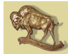
Fig 20 Manitoba Volunteer reserve