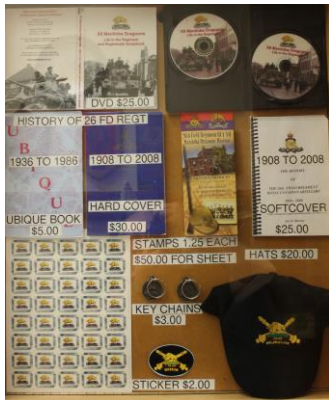
Fig 23 26XII Museum Kit Shop