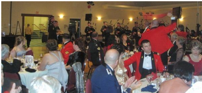
Fig 35 The over 200 people at the 65 th military Ball enjoy the music of the 26 th Field Pipes and Drums.