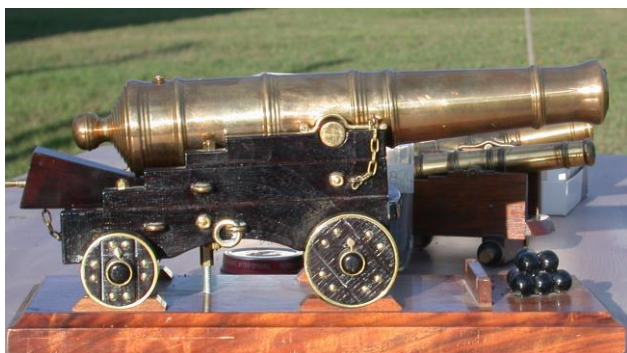
Fig 21 26XII Museum Deck Gun

Identify the Artefact: For answer see next issue of