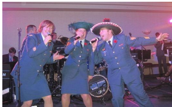
Fig 29 The Jet Stream trio belts out a tune