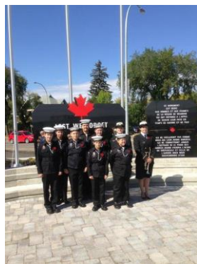
Fig 6 RCSCC SWIFTSURE