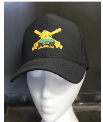
Fig 25 26XII Museum Hat $20

All items show at Fig 23 are in stock items, shirt at Fig 24 has to be ordered please see curator for details.