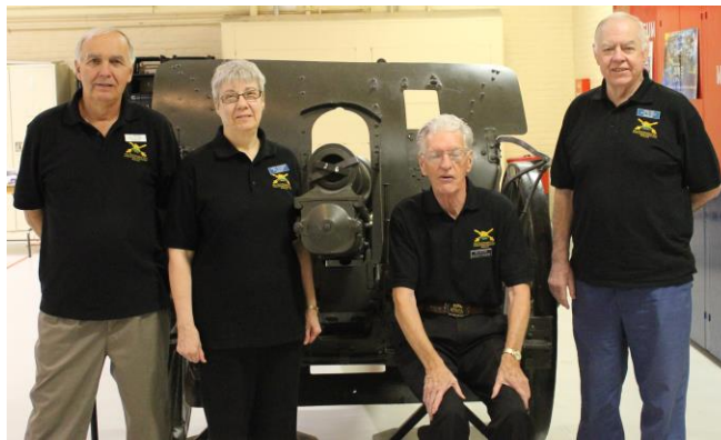
Fig 24 26XII Museum Golf Shirt