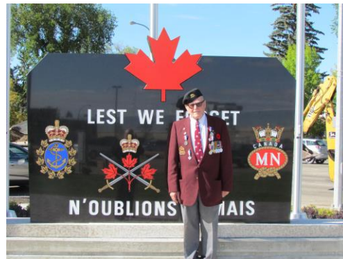
Fig 8 Art Lyon XII Mb Dragoon WWII Veteran