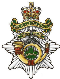
Fig 18 Halifax Rifles