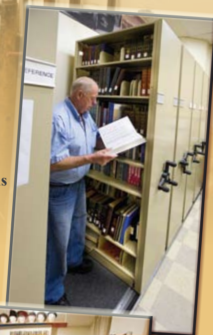
The Archival and Library Section contains valuable information available to anyone doing research.