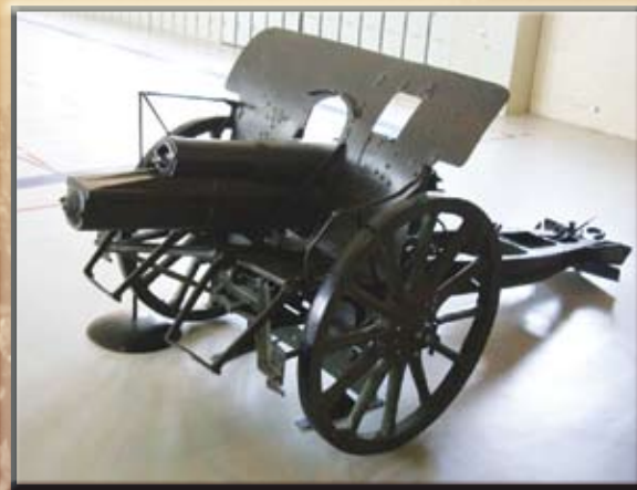
German 105mm Field Gun built by Krupp Works in 1911.