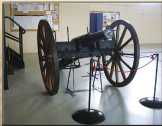
9 Pounder Muzzle Loading Rifle Circa 1871