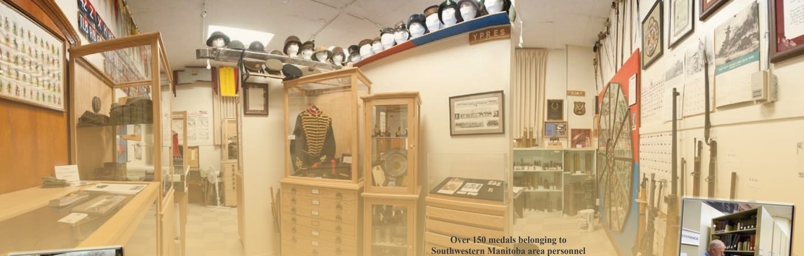
Over 150 medals belonging to Southwestern Manitoba area personnel on display including Capt. J. Kirkcaldy's WWI medals.