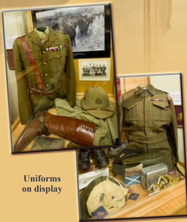
Uniforms on display