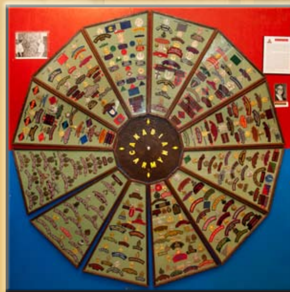
474 badges and shoulder flashes representing five divisions, two corps and two C.O.T.C. troops plus an additional 400 cap badges.